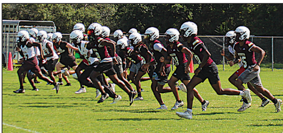
The Wekiva football team run sprints together as a team at the end of fall practice.