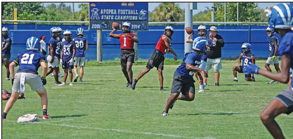
All three of Apopka's quarterback do route drills at the same time aiming for different receivers at different levels in coverage on Tuesday, July 30.