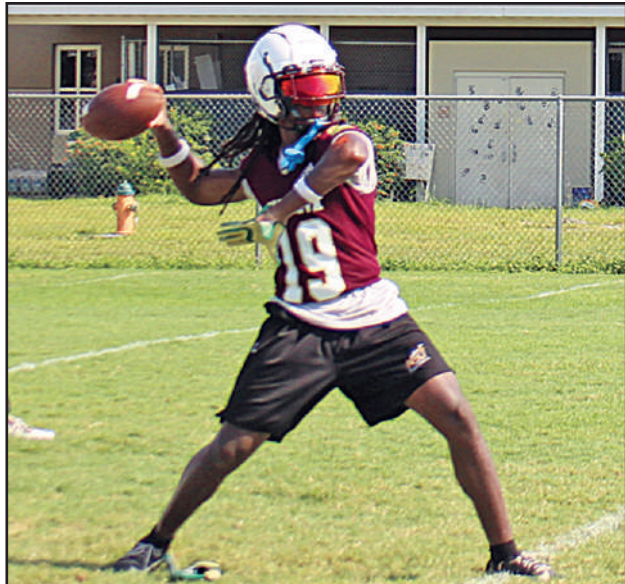
A Wekiva quarterback winds up for a big pass during the first week of fall practice.