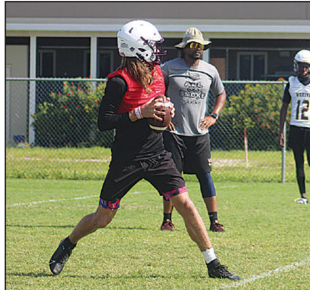
Another Wekiva quarterback drops back and surveys the defense before making a pass.