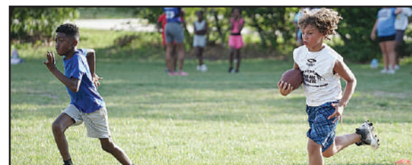
Two Pop Warner players run sprints during off-season conditioning on Monday, June 10.