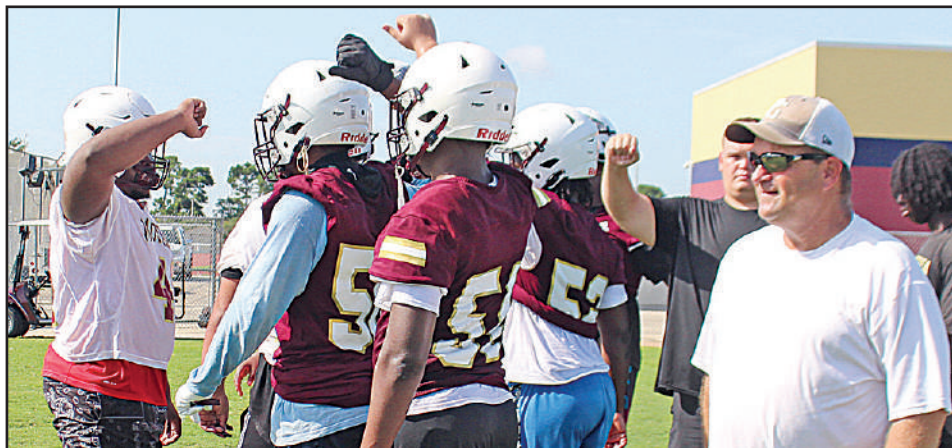
Wekiva players huddle up and break down after speaking to coaches during fall practice.