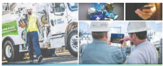
HURRICANE PREP IS EVERY DAY, 24/7

Special 3/4: Pay for 3 weeks get the 4th week free.