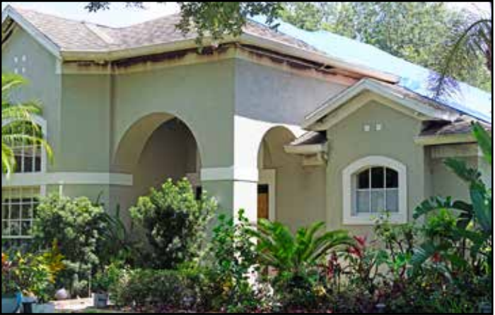
One of four houses destroyed by fire after lightning strikes.

ka firefighters discovered an active house fire and quickly put it out. Less than an hour later, at 9:53 p. m., another lightning strike hit a third home in the 900 block of Offaly Court. Again, Apopka crews responded and brought that fire under control. The third call came in at 11:09 p. m., when lightning struck the fourth and final house in the 4000 block of