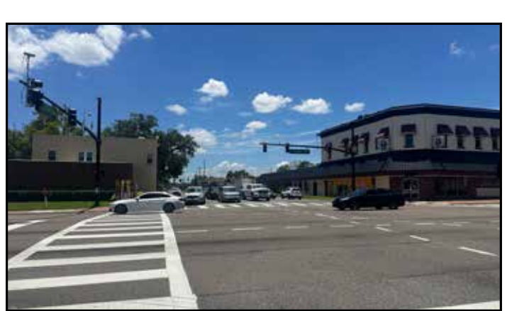
The U.S 441 -South Park Avenue intersection, part of downtown Apopka.