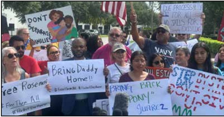
Protesters hold signs outside the ICE Field Office in Orlando on June 13.

“Growing up, I always had a fear in the back of my mind,” she said. “I’ve been