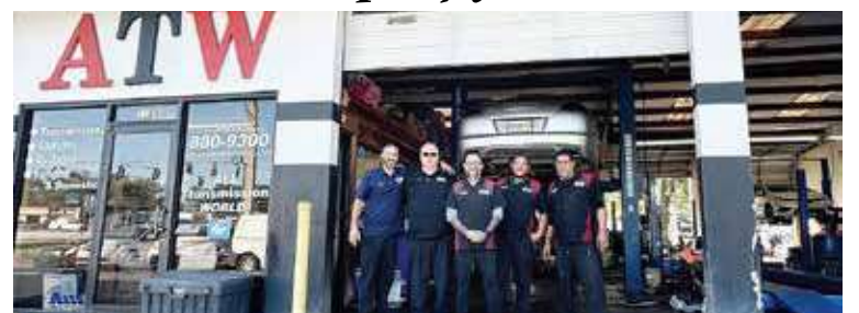
To keep you and your loved ones safe on the road, take your car to an auto repair shop that is widely known for their superior service and expertise. Visit All Transmission World, conveniently located at 1150 E. Semoran Boulevard in Apopka. Call them today at 407-880-9300.

The professionals at All Transmission World know that keeping an eye on everyday wear and tear can stop small