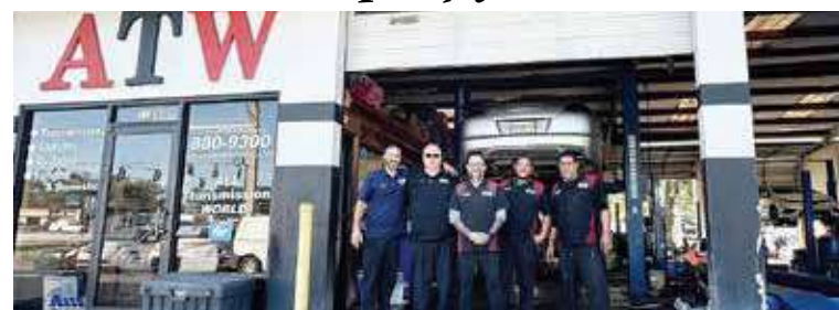
To keep you and your loved ones safe on the road, take your car to an auto repair shop that is widely known for their superior service and expertise. Visit All Transmission World, conveniently located at 1150 E. Semoran Boulevard in Apopka. Call them today at 407-880-9300.

The professionals at All Transmission World know that keeping an eye on everyday wear and tear can stop small