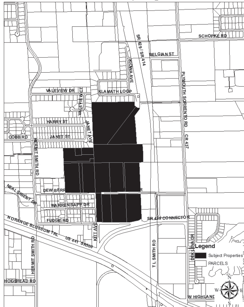
(THIS MAP IS FOR REFERENCE PURPOSES ONLY AND IS NOT TO SCALE)

NOTICE is given that a public hearing for Ordinance Number 3061 will be held by the City of Apopka City Council at its regularly scheduled meeting in the City Council Chambers of the Apopka City Hall, 120 E. Main Street, Apopka, Florida on Wednesday, July 17, 2024 beginning at 7:00 P.M.