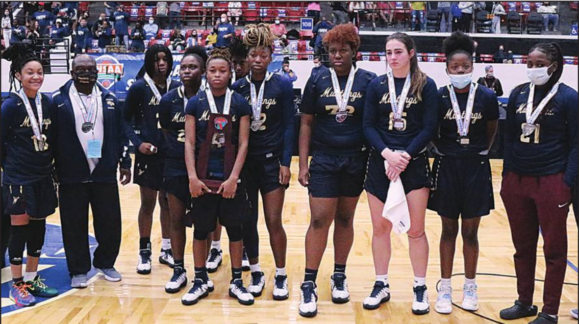
On Saturday, February 27, the Wekiva Mustangs played their last game of the season. The Mustangs lost the Class 6A state final game against St. Thomas Aquinas in a close 62-60 game.